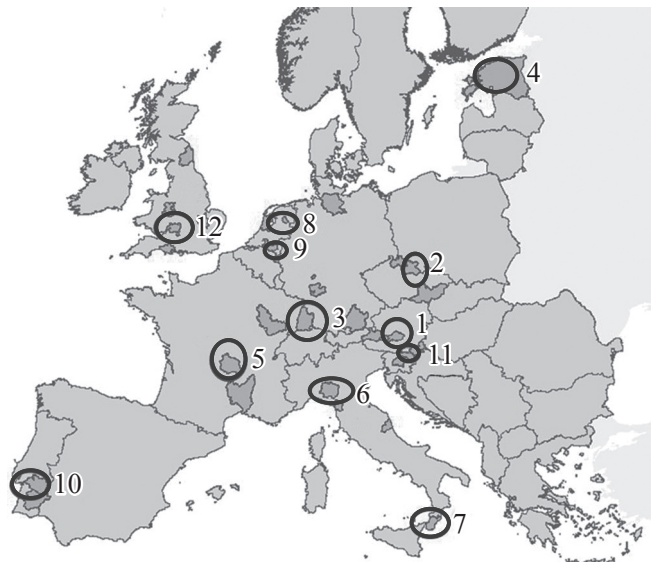
Figure 1: Locations of all 34 case study areas in the PEGASUS H2020 research project. The circles indicate the twelve in-depth case studies listed in Table 1.

While it is already a challenge to evaluate the impact of a certain driver on the provision of a single ESBO, it is even