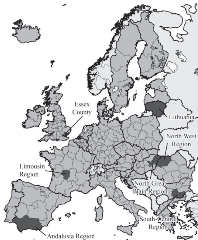
Figure 1: Locations of the RuralJobs research. Results from Andalusia Region and Lithuania are not included in this paper.

The EU Framework 7 project ‘RuralJobs’ ( www.rural-jobs.org ) carried out case study research in Bulgaria, France, Hungary, Romania and the UK (Figure 1) to assess the potential for new sources of employment in rural areas. To maximise the representativeness of the results at EU level, the research was carried out in the rural territories of eight contrasting (in terms of GDP per capita, accessibility to urban centres of 50,000 or more inhabitants, and population density) case study areas (Table 1). Where possible, each case study area consisted of a ‘labour market’ or ‘employment’ area, as follows: ‘Travel to Work Area’ (TTWA) in the UK (Bond and Coombes, 2007); ‘Local Labour System’ (LLS) in Hungary (Radvánszki and Sütő, 2007); and ‘agglomeration area’ (AA) in Bulgaria (Anon., 2007). In France, a ‘Pays’ is the result of a collective bottom-up approach with regional